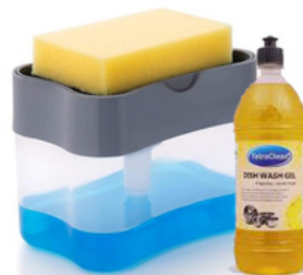
Dish Wash + Gel

Note : The images show are for illustration purposes only and may not be an exact representation of the product. Actual device may different from the image show.