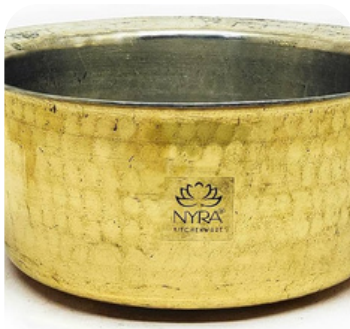
Pital Ganj 2