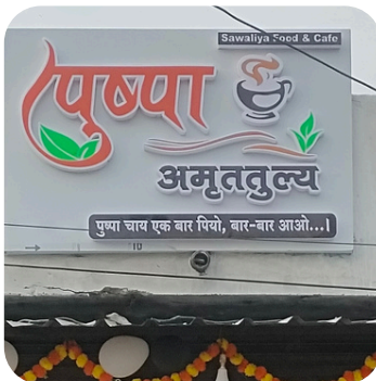
Main Board 3D (6*4)