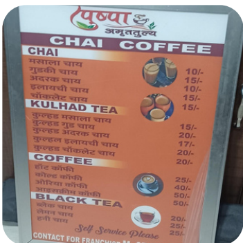
LED Light Menu Board