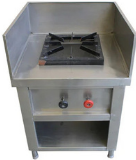
Steel Bhatta (Sigadi)